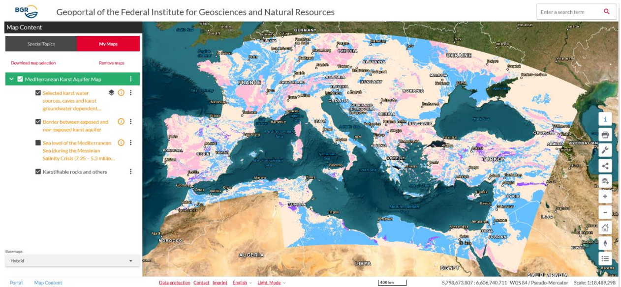
Figure 2: MEDKAM as shown in the BGR Geoviewer. On the left side, different layers of the map can be (de)activated, and attribute tables can be opened.

The implementation of the MEDKAM to the BGR Geoviewer was completed on 6 th of March 2023. There, the MEDKAM is accessible as a WebGIS (Figure 2).