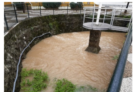
Figure 1: Algarrobal spring at Ubrique test site during a contamination event with high turbidity.

The existence of previous investigations at these study areas exposed that the main water quality issues were related with high turbidity periods and associated fecal contamination after intense rain events that impede groundwater use for water supply population. Thus, in KARMA test sites, spring discharge as well as hydroclimatic and physical-chemical parameters of water (electrical conductivity, temperature and turbidity) were continuously monitored. Furthermore, fluorescence-based techniques and microbiological culture-based methods (i.e. E. Coli ) were commonly used to detect organic and bacteriological contamination. According to the features of each system, specific techniques were applied at each test site to better identify groundwater origins and contaminant transport processes: Cl - and Dissolved Oxygen (DO) in Lez system, Particle Size Distribution (PSD) and bacterial enzymatic activity ( \beta -d-glucuronidase) in Hochifen-Gottesacker and PSD, trace elements and Rn 222 in Ubrique test site.